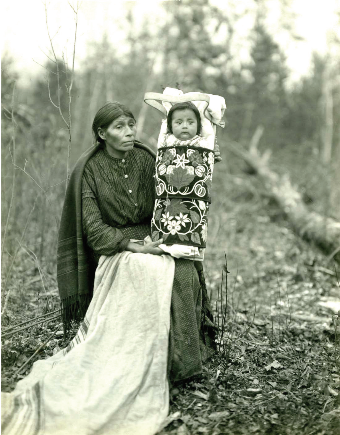
(IU Museum of Archaeology and Anthropology Digital Exhibits)